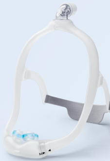
DreamWear Gel pillows mask