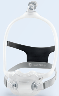
DreamWear Full face mask

Note: Switching from a nasal cushion to a full face cushion requires different headgear and instructions. Consumers must consult their provider before making adjustments.