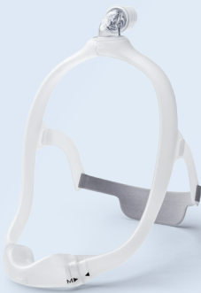
DreamWear Nasal mask